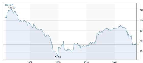
Figure 2: Price development of the convertible bond.

Unfortunately, the share price developed in the opposite direction. In August 2011 Cytos announced that it restructures the company in order to preserve value for the upcoming maturity of the convertible bond. One could read that in the following way: "We do not have sufficient cash and even by firing most of our staff we face the danger of bankruptcy". On October 5, 2011, Cytos' market capitalisation is CHF 11 mn, which can be interpreted as pure option value, i.e. value of the scenario where Cytos is actually able to survive the maturity of the convertible bond.